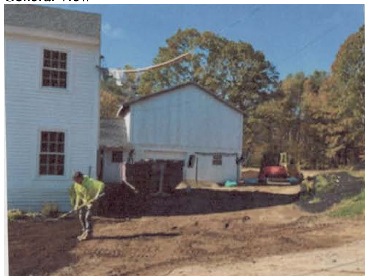
Locations of the lights