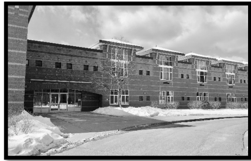
Royalston Community School Winchendon Road