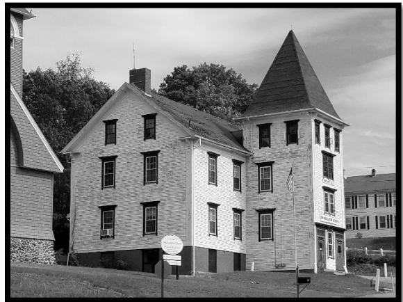
Whitney Hall South Royalston