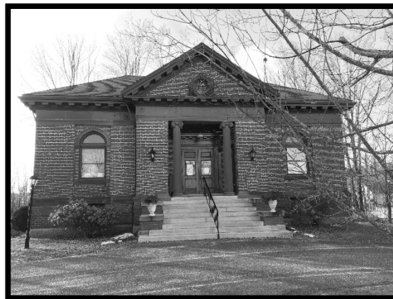
Phinehas Newton Library On the Common

The three trustees oversee all library operations, including hiring the director and approving the hiring of other employees. Working with the director, they develop library policies and oversee their implementation and enforcement, develop the annual budget and ensure it meets the requirements for state aid, and make and/or approve recommendations on capital and maintenance issues. Advocating for the library and upholding the library bill of rights, which promotes the freedom to read and the freedom to view, are central to the overall responsibility of each trustee. Email: LibraryTrustees@royalston-ma.gov