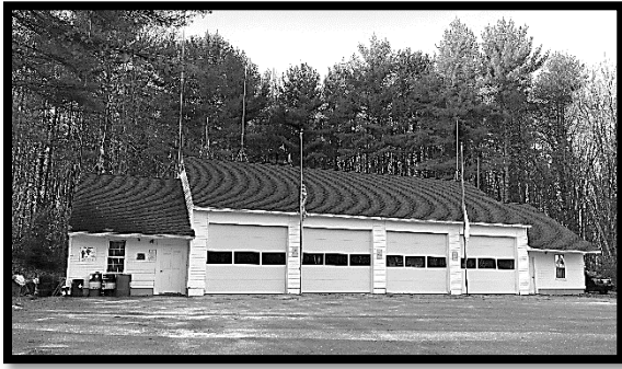
Fire Station No. 1 and Police Station On the Common