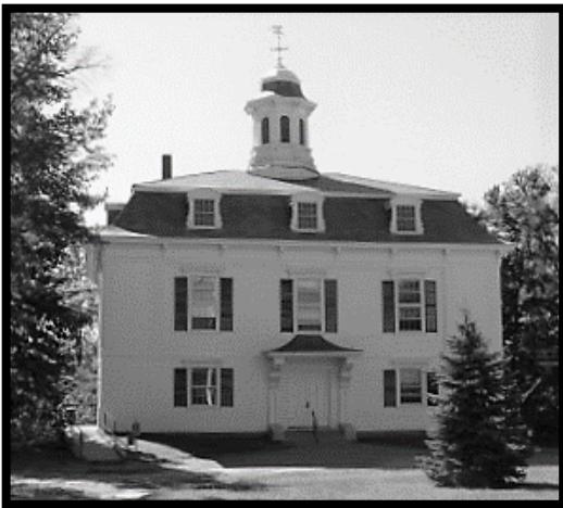
Royalston Town Hall On the Common