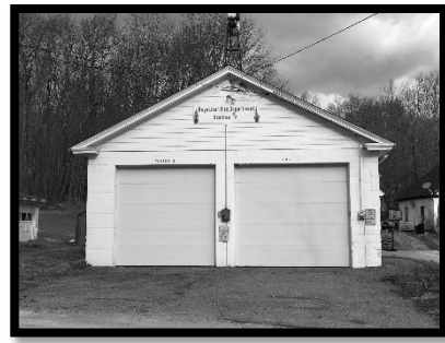
Fire Station No. 2 South Royalston