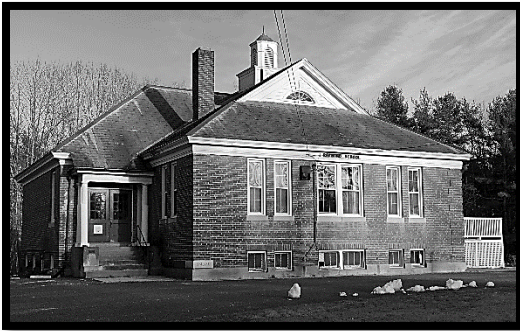
Raymond School On the Common