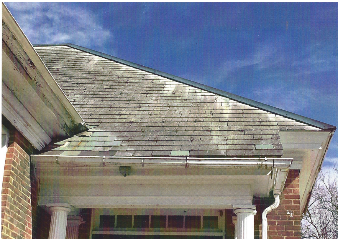
Existing Raymond School Roof