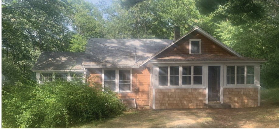
Photo showing new trim on porch corners and around porch door. Now matches the house's front door trim.