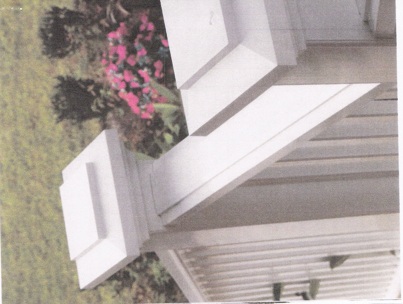
AZEK RESERVE RAILING