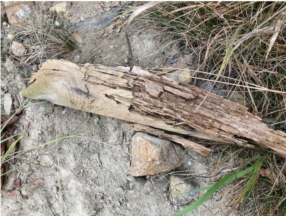
Figure 2: Piece of sill from the north side