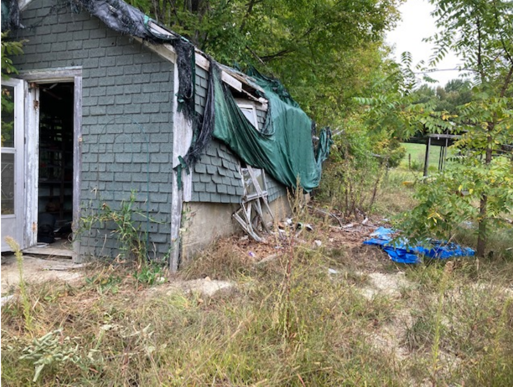
Figure 1: Southeast corner of the shed (former post office). The north side has been destroyed by termites