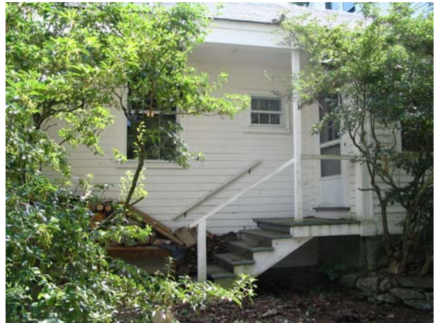
Looking SW. The kitchen is on the right. Kitchen door will be replaced by window.