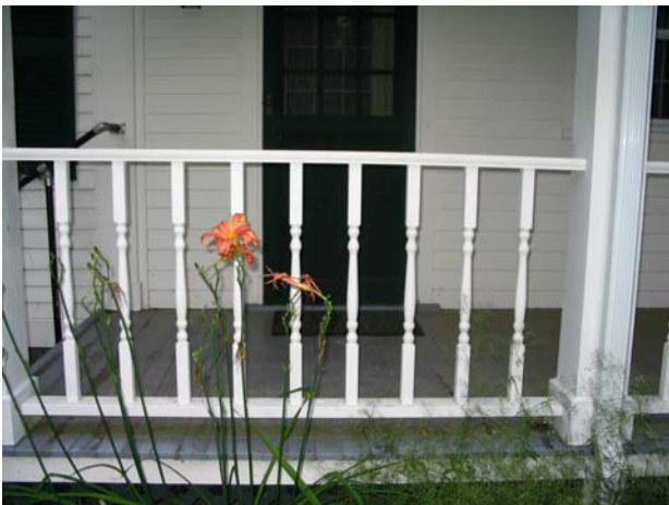
Proposed railing style (imitate Columns porch)