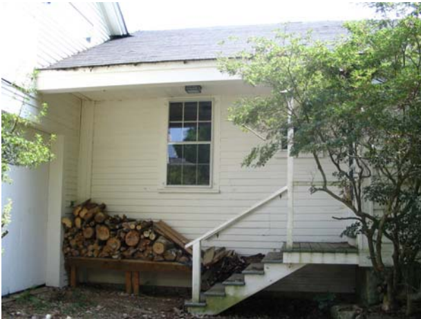
Looking SE. The barn is on the left. Window will be replaced by door.